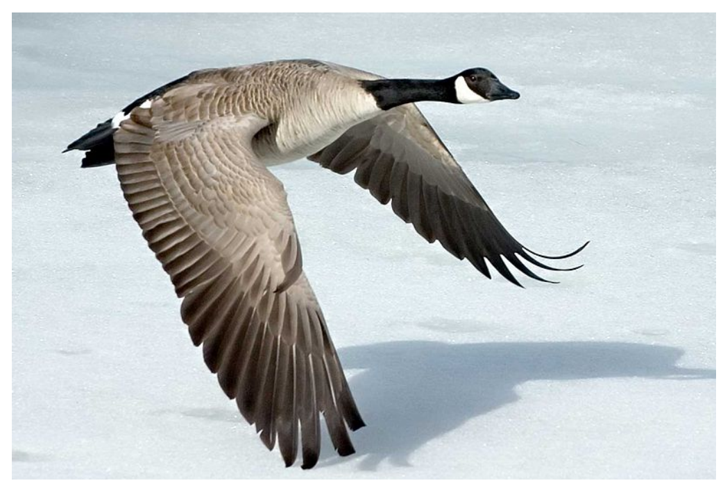
Canada Goose (Kanadagans)