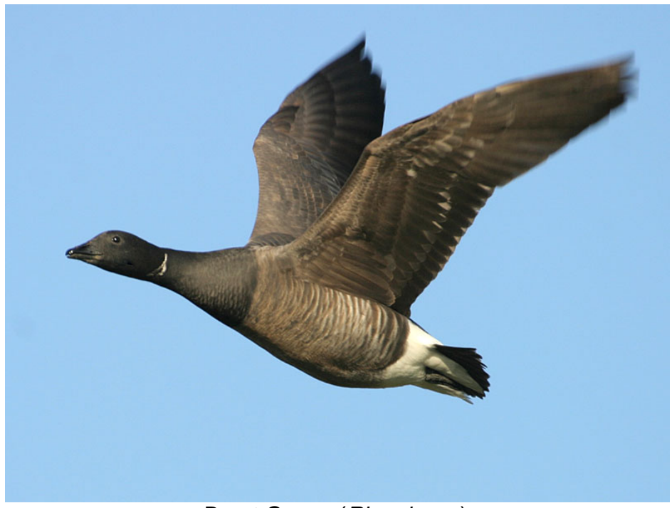
Brent Goose (Ringelgans)