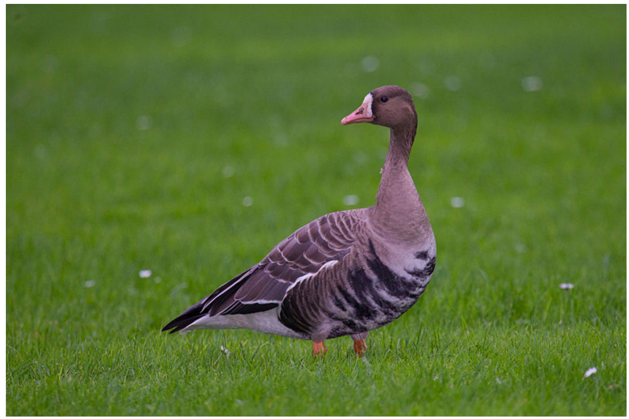
Greater White-fronted Goose (Blässgans)

The name for the White-Fronted Goose ( Blässgans ) comes from the white spot above the bill.