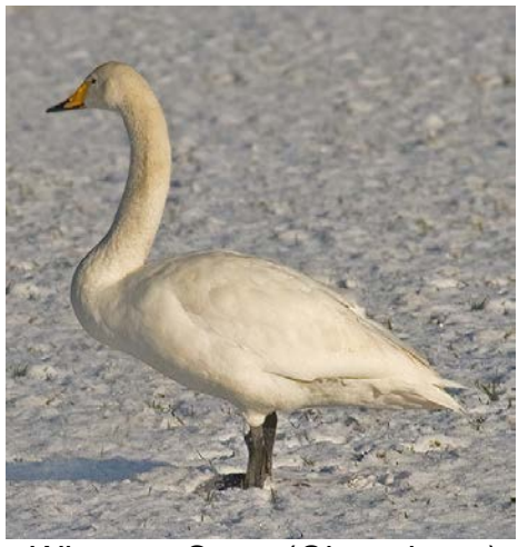
Whooper Swan (Singschwan)