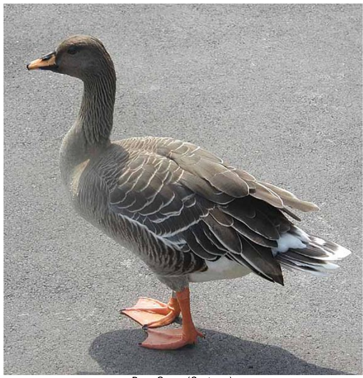
Bean Goose (Saatgans)

The Bean Goose ( Saatgans ) is about 3 inches smaller than the Greylag goose. The German name for the Bean Goose comes from its diet of seeds and seedlings ( Saat ). The Bean Goose often feeds in grain fields. The bill is black with reddish-orange, its feet are yellow, and its overall color is darker than that of the Greylag Goose.