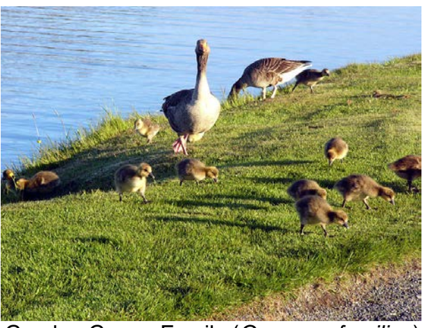
Greylag Geese Family (Graugansfamilien)

The average Greylag Goose ( Graugans ) weighs 8 to 9 pounds. It is about 32 to 35 inches long with a wingspan of 64 inches. The Graylag Goose's overall color is gray, the bill is orange with a white tip, and the feet are pink, and the under parts are whitish. The call of the wild goose resembles the call of the domestic goose.