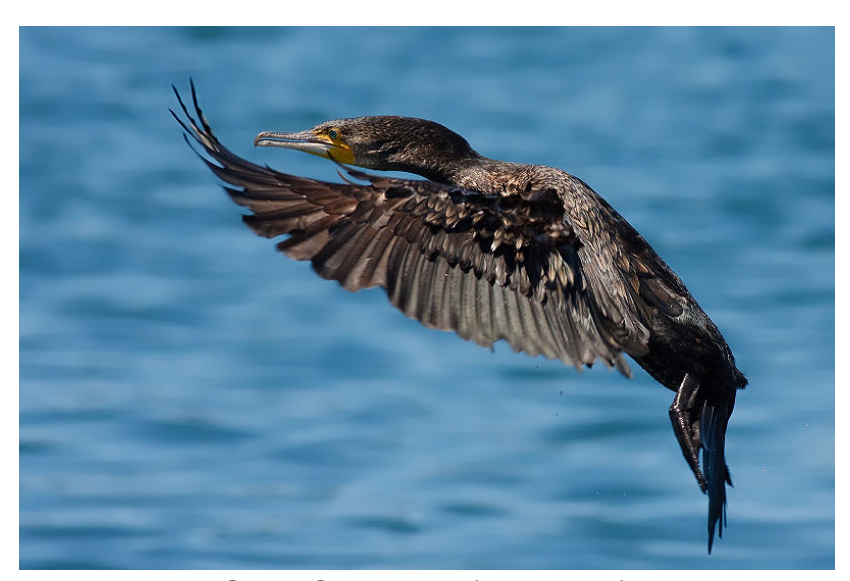
Great Cormorant (Kormoran)