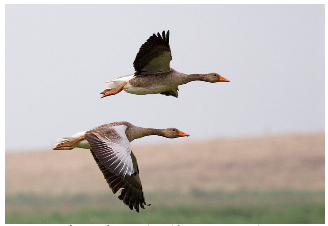
Greylag Geese in flight (Graugänse im Flug)