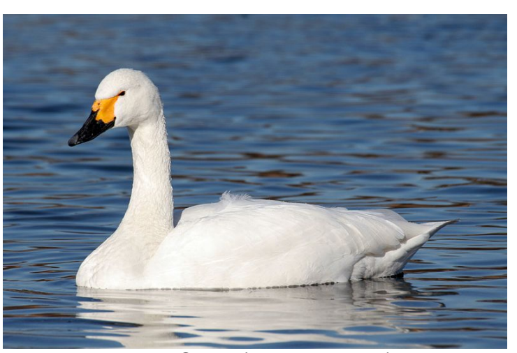
Tundra Swan (Zwergschwan)