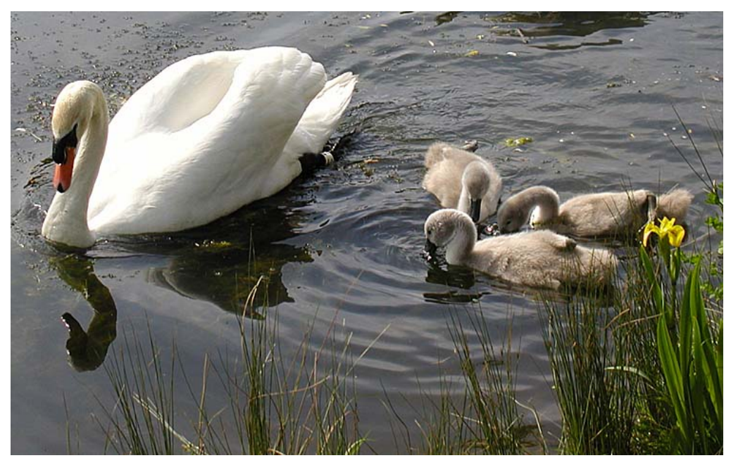
Mute Swan (Höckerschwan)

Only the Mute Swan ( Höckerschwan ) is open for hunting, from 1 September until 15 January.