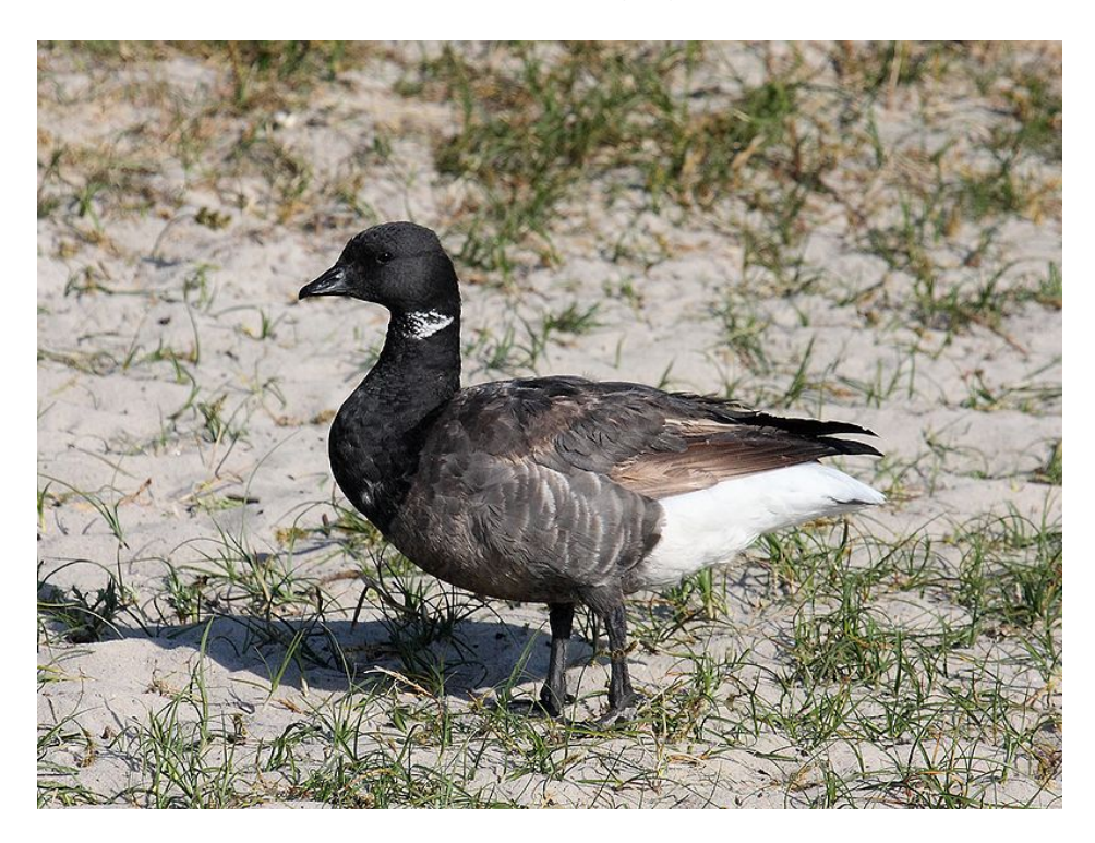
The Brent Goose ( Ringelgans ) is easily distinguished by the white ring around its neck. At maturity, these geese are normally 22 inches long. The wing span may reach 45 inches. The bird's overall coloring is black.