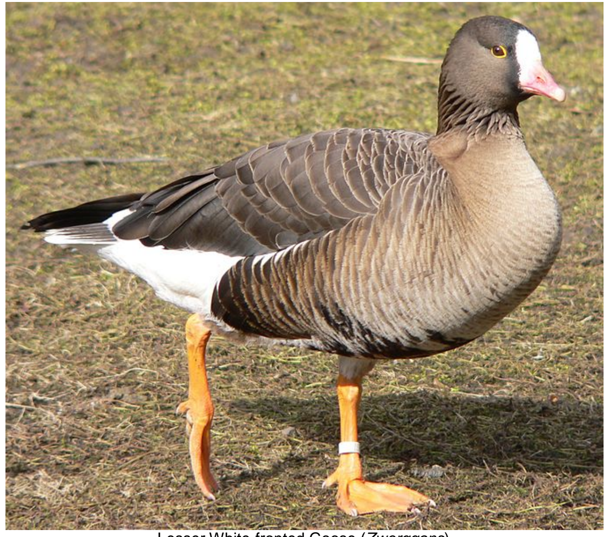
Lesser White-fronted Goose (Zwerggans)

The length of the Lesser White-Fronted Goose ( Zwerggans ) is 26 inches.