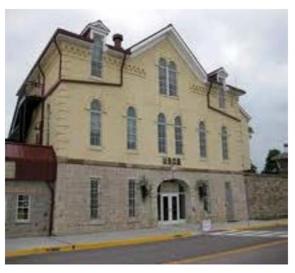
Commemorating the historic United States Disciplinary Barracks, the "12th Brick" refers back to inmate produced bricks used to build "the castle" for the prison. Every 12th brick was stamped with USMP (United States Military Prison).

310 McPherson Ave. Fort Leavenworth, KS 66027